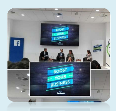
SISTRADE at AICEP Conference -Boost Your Business with Facebook